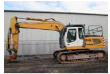
2012 Liebherr R916 – 1,614 hours