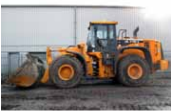
2012 Hyundai HL760-9 – 1,570 hours