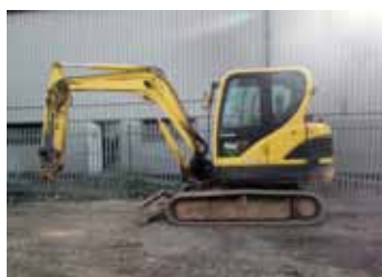
2010 Hyundai R55-9 – 2,725 hours