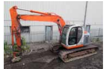
2003 Fiat Kobelco 135SRLC-1F – 7,126 hours