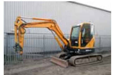
2011 Hyundai R60CR-9 – 2,294 hours