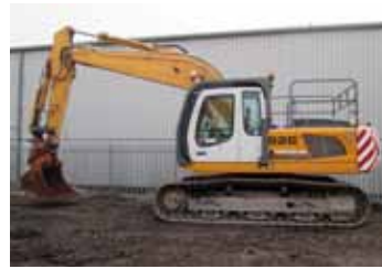
2012 Liebherr R926C – 949 hours