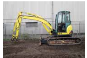
2013 Yanmar VIO57 – 537 hours