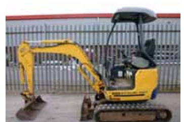
2009 New Holland Kobelco E18SR – 1,838 hours