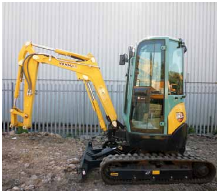
New & Unused 2013 Yanmar VIO25 – 5 hours