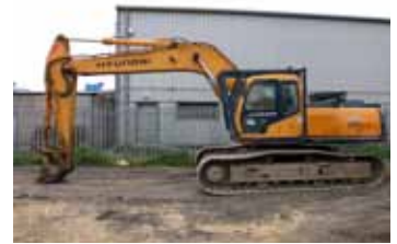
2000 Hyundai R290LC-3 – 7,000 hours