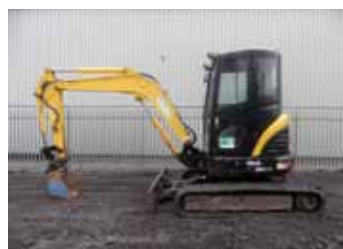
2008 Hyundai R35Z-7 – 3,070 hours