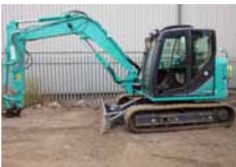
2013 Yanmar VIO80 – 627 hours