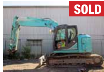
2013 Kobelco SK140SRLC-3 – 1,061 hours