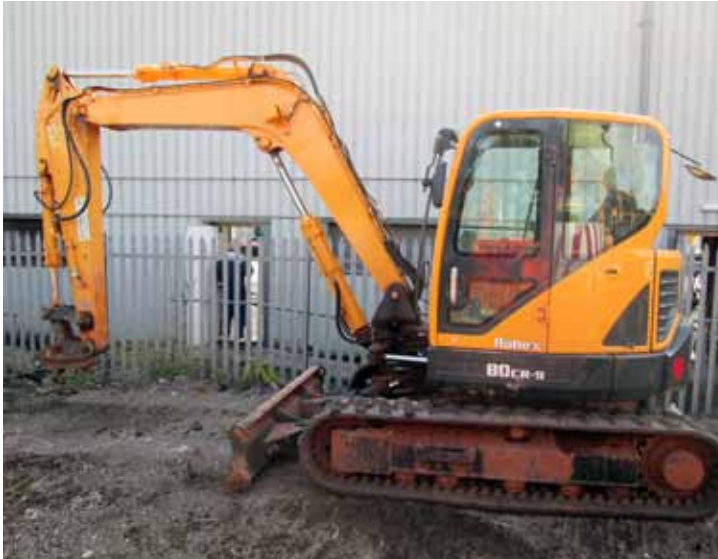
2014 Hyundai R80CR-9 – 739 hours