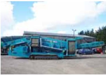
2012 Powerscreen Warrior 1800 – 4,018 hours