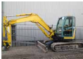
2013 Yanmar VIO80 – 565 hours