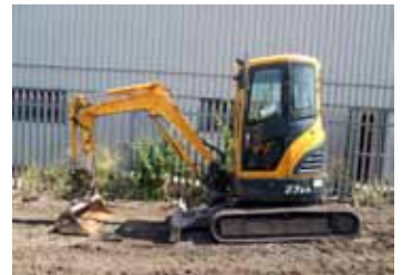
2011 Hyundai R27Z-9 – 1,585 hours