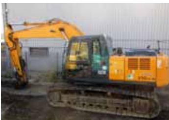
2009 Hyundai R210LC-7A – 7,326 hours