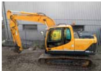
2014 Hyundai R140LC-9 – 578 hours