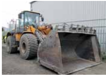
2010 Hyundai HL760-7A – 7,652 hours