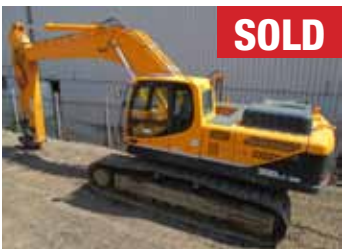
2013 Hyundai R300LC-9A – 782 hours