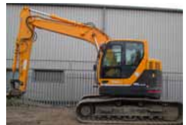
2014 Hyundai R145LCR-9A – 667 hours