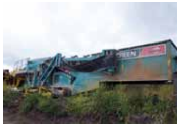
2012 Powerscreen Chieftain 1400 – 3,441 hours