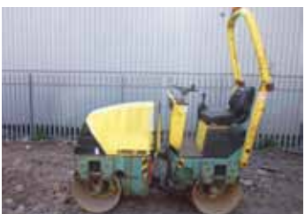
2007 Ammann AV12-2 – 710 hours