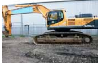
2011 Hyundai R520LC-9 – 4,498 hours