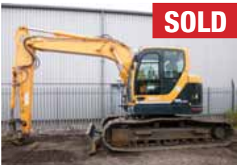
2014 Hyundai R145LCD-9 With Blade – 563 hours