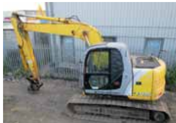
2007 New Holland Kobelco E145 – 6,898 hours