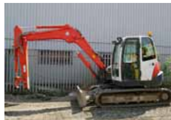
2011 Kubota KX080 – 3,002 hours