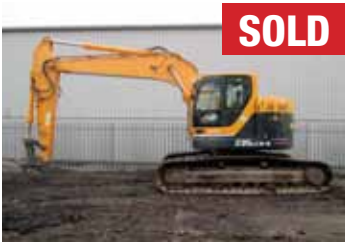
2013 Hyundai R235LCR-9 – 661 hours