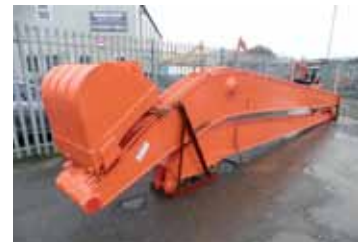
New & Unused Hitachi ZX200-3 Long Reach