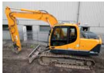
2013 Hyundai R140LC-9 With Blade – 619 hours