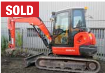
2013 Kubota KX057-4 – 637 hours