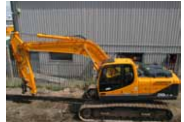
2013 Hyundai R210LC-9 – 809 hours