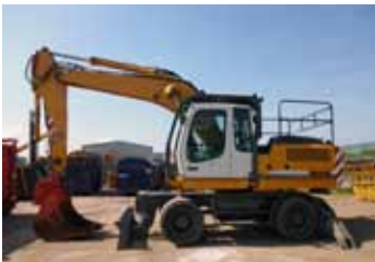
2012 Liebherr A914C – 364 hours