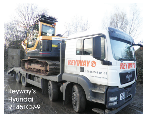
Keyway's Hyundai R145LCR-9

This positive experience together with the back-up provided by both Hyundai and Molson convinced Keyway to invest in the Hyundai brand once again.